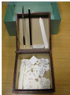
Tools of the Trade